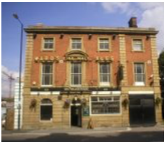
Shakespeare's Pub (from their website)